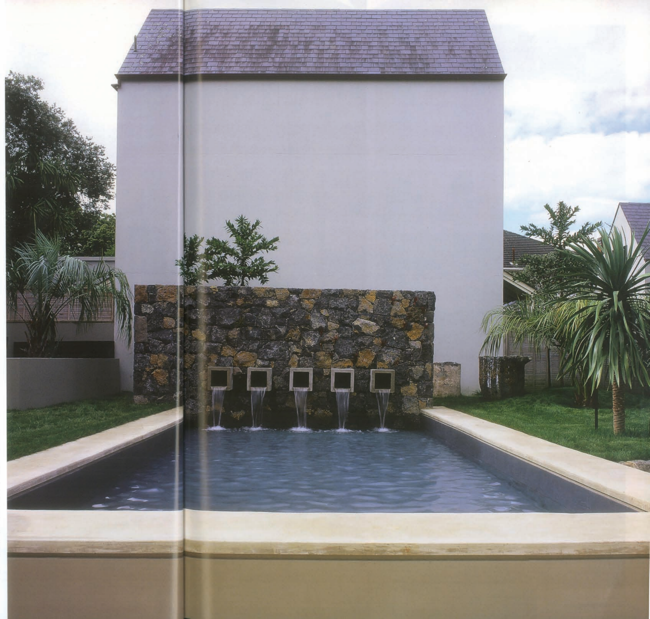
Right: The water feature in this garden dominates the design. At night, the water reflects the lights from the house. In the day, it helps give the garden a contemplative atmosphere.

Aside from its contemporary aesthetics Wendelborn says the design's minimal maintenance requirements suit a modern, busy lifestyle.